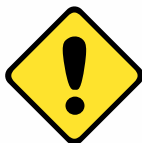
WARNING NO LIFESAVING SERVICE

Warning Signs (diamond shape, yellow and black) are used to warn you about a hazard(s) at the beach.