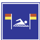
PATROLLED BEACH 5KMS AWAY

Information Signs (square, blue and white) are used to provide you information about features at the beach.