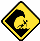
UNEXPECTED LARGE WAVES