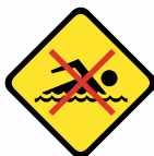
SWIMMING NOT ADVISED