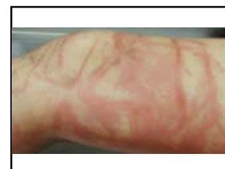
Severe Chironex sting