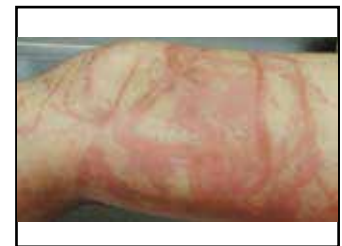
Severe Chironex sting