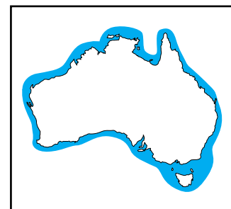
Distribution in Australian waters